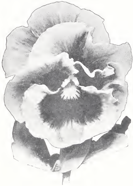
Photo of type found in Miracle Mixed